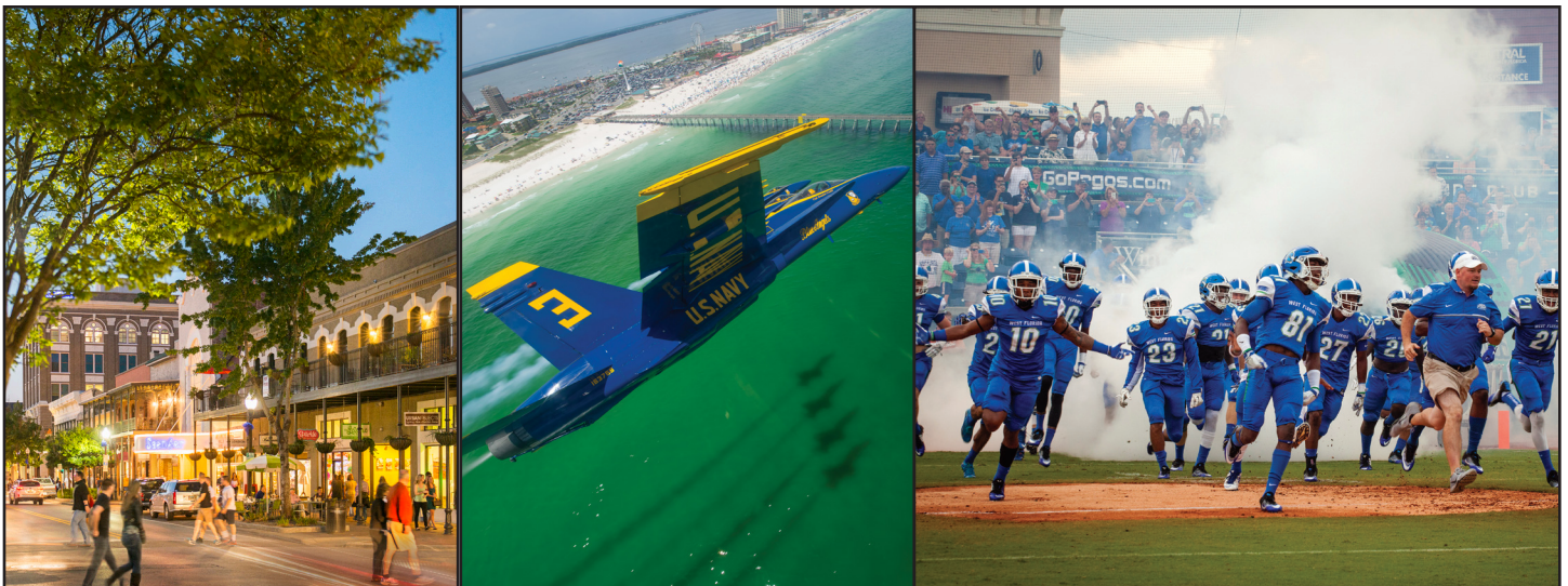
From left to right: Palafox Street in Downtown Pensacola, the Blue Angels, and the University of West Florida football team.