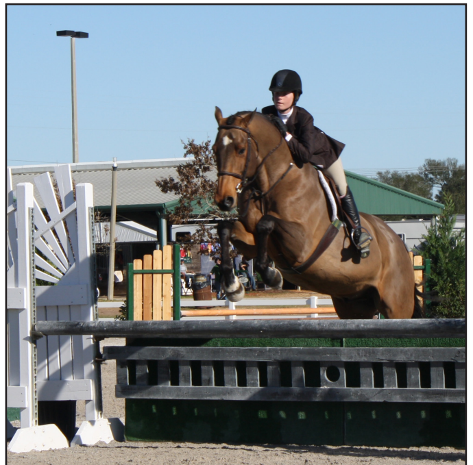
From top to bottom: Cotton field, Equestrian Center