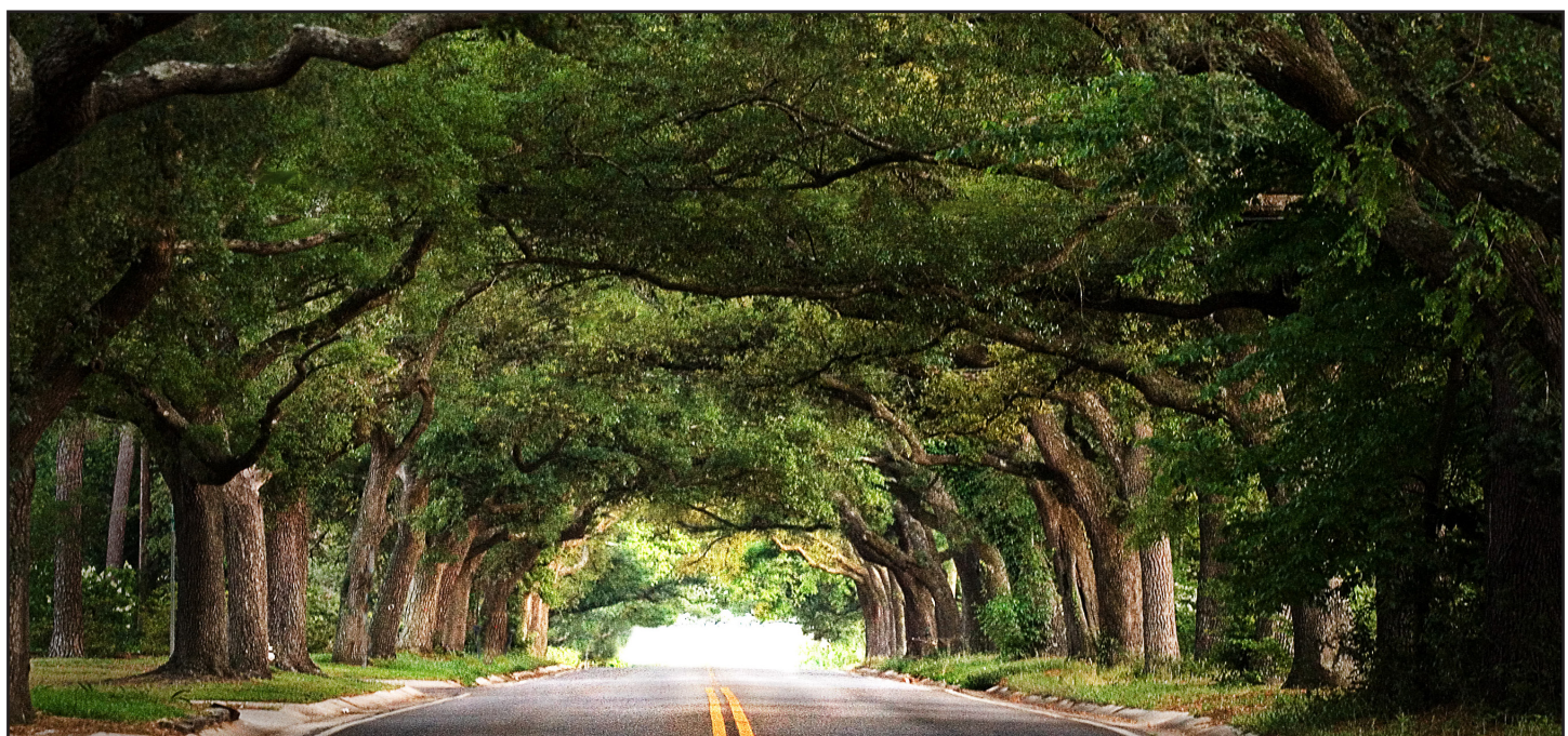
12th Avenue tree “tunnel”