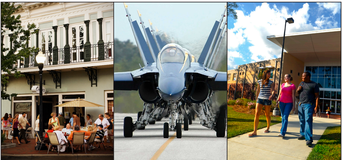
From left to right: Gallery Night on Palafox Street, the Blue Angels, students at the University of West Florida