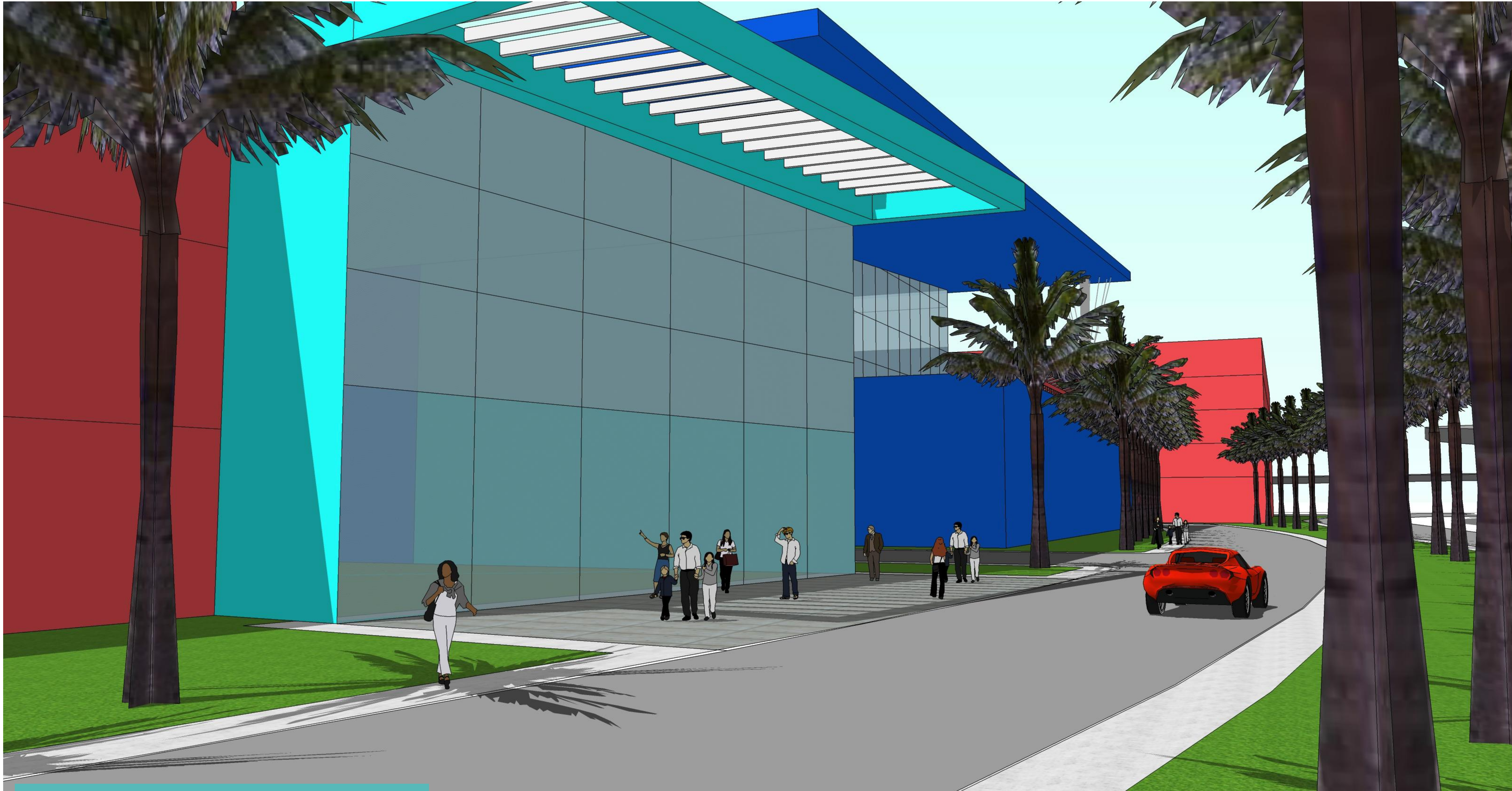
Prefunction Entry View

© 2017 The Board of Directors of the Escambia County Sport and Activity Center. All rights reserved. This document is the property of the Board of Directors of the Escambia County Sport and Activity Center. It is not to be reproduced, stored in a retrieval system, or transmitted in any form or by any means, electronic, mechanical, photocopying, recording, or by any information storage and retrieval system, without the prior written permission of the Board of Directors of the Escambia County Sport and Activity Center. Use of this document is limited to the specific project and is not to be used for any other purpose. The design is preliminary and subject to change without notice. The design is not to be used for any other purpose without the prior written permission of the Board of Directors of the Escambia County Sport and Activity Center. The design is not to be used for any other purpose without the prior written permission of the Board of Directors of the Escambia County Sport and Activity Center. The design is not to be used for any other purpose without the prior written permission of the Board of Directors of the Escambia County Sport and Activity Center.