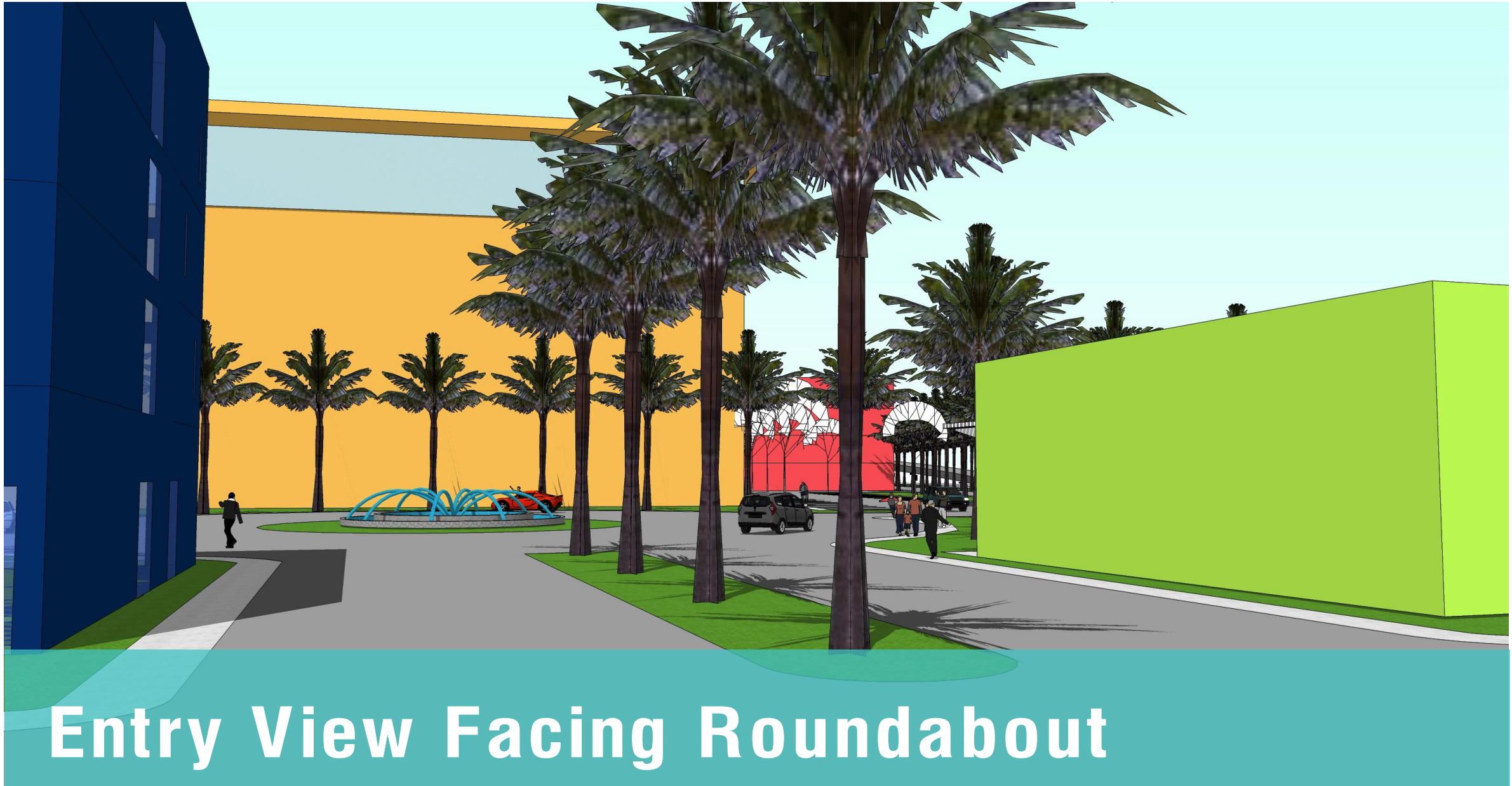
Entry View Facing Roundabout