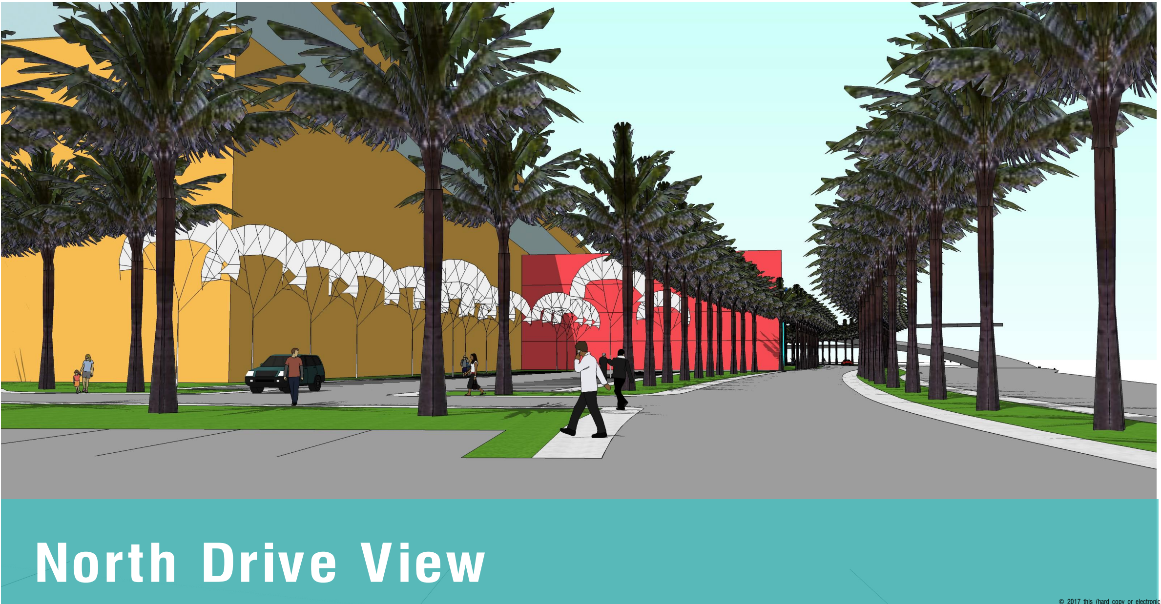
North Drive View