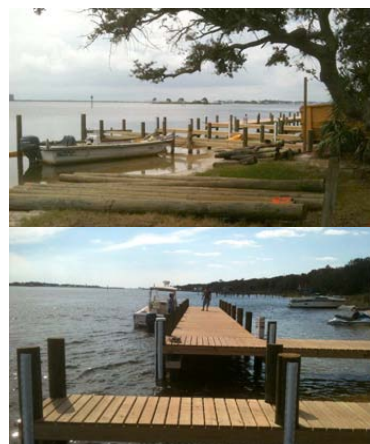
Figure 1: (Top) Construction of the boat ramp. (Bottom) Completion of the ramp.

Total Funding Allocated (For all four boat ramps: Mahogany Mill, Perdido River, Galvez Landing, and Navy Point: $4,422,768 Status: Complete