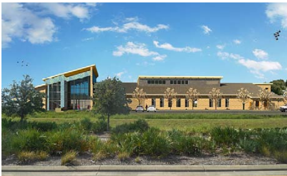
*DRAFT render by subject to change (Baskerville-Donovan)

Contractors: Baskerville-Donovan (Conceptual design below)