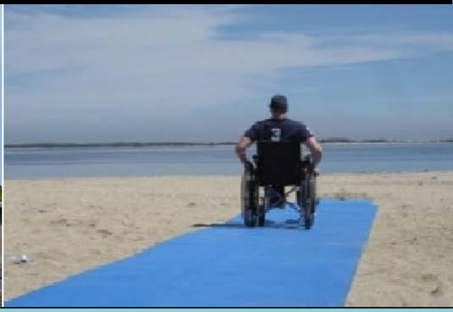
RANK: INFRASTRUCTURE- 4. OVERALL- 6