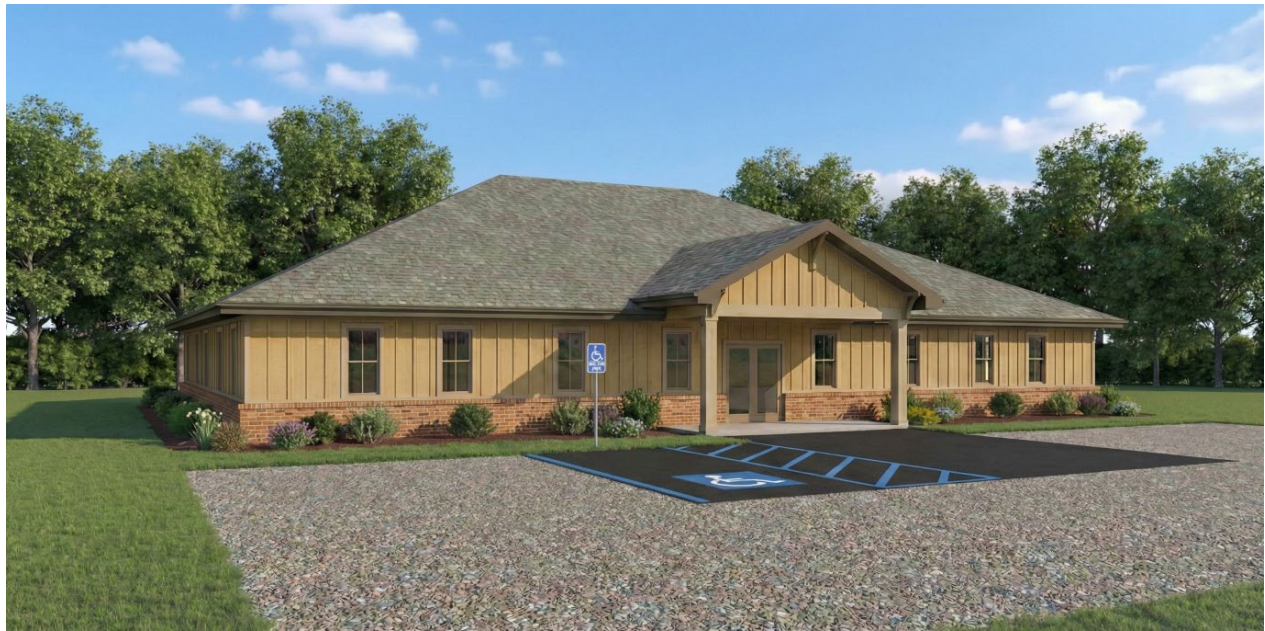
Charis House Exterior Architectural Rendering