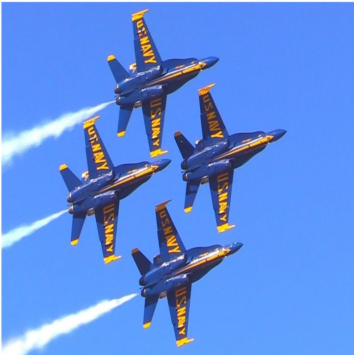
Pensacola Beach Air Show July 12th, 2025