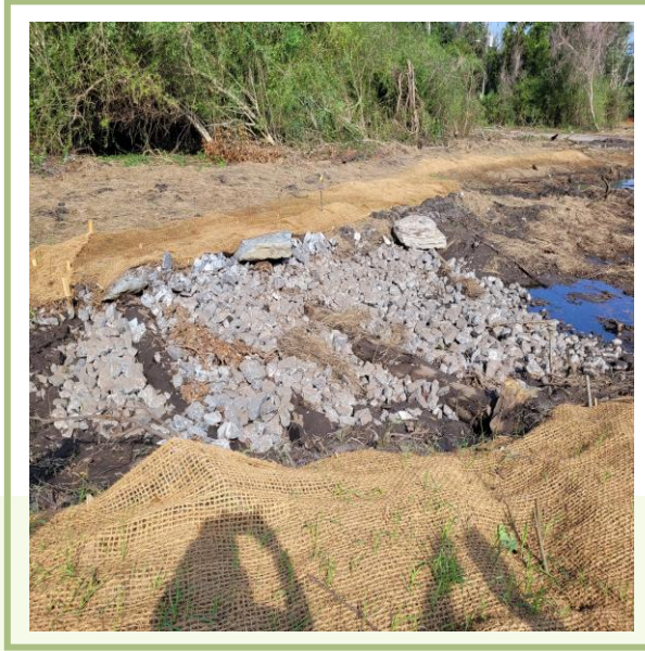
LOG DROP WITH BOULDERS