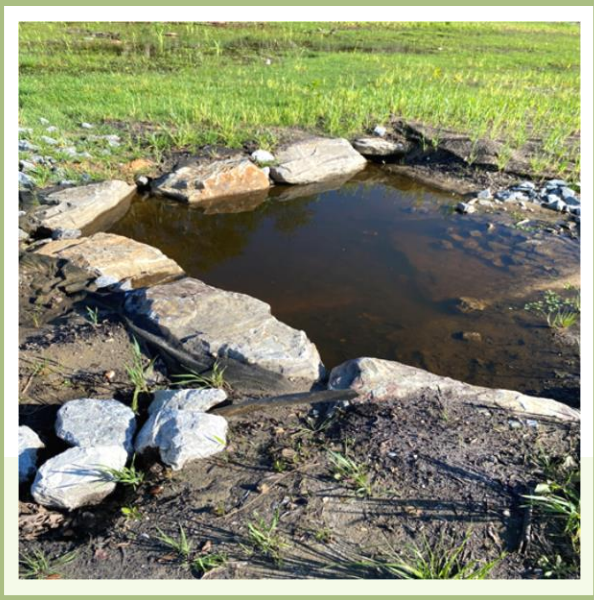
ROCK CROSS VANES